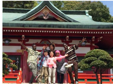
Sightseeing in Tochigi Prefecture

After completing ABE Initiative, we went back to Africa to contribute to industrial development in our respective countries as per the program's objective. In my case, with two other ABE initiative graduates from Kenya we formed Higashi Africa Investment Company, HAIC, (www.higashiafrica.com) a consulting and advisory firm with the objective to contribute to industrial development in Africa through promotion and support of foreign investments. HAIC head office is