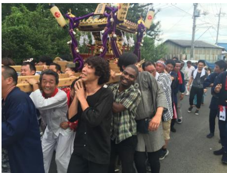
Enjoying Japanese summer festival

Studying in Japan was the best opportunity for us young people from Africa. From the friends we met to learning the language and exploring regions of Japan. The experience was