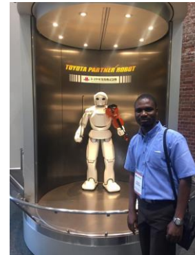
Internship at Toyota

During summer vacation and after graduation, we had opportunities to undertake internship at Japanese companies and visit many other business partner companies. For example, personally, I took internship at three different companies; Asahi Glass Company (AGC), the largest glass manufacturer in the world, Japan Management Corporation, dealing with housing maintenance and management, and KOYO Corporation, dealing with renewable energy and energy serving technologies.